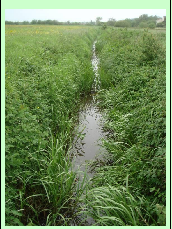
Ditch with reeds

Vernacular term used to group numerous tall, often unrelated grasslike plants of wet places.