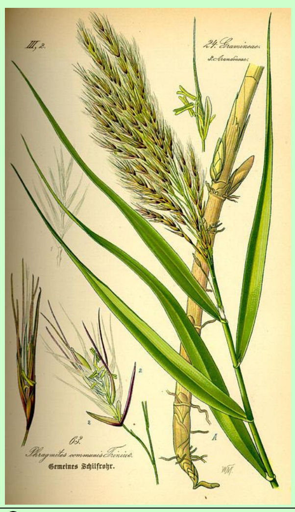
Around the world